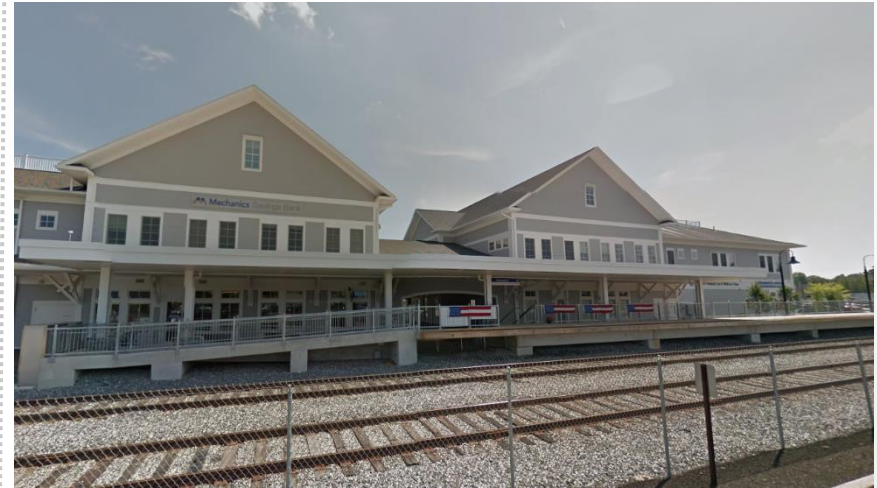
The completed Brunswick, ME rail station in 2013