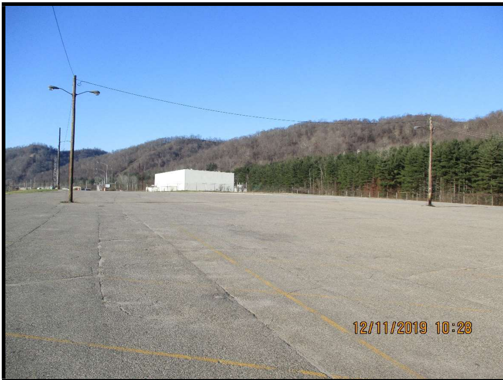
Photograph 14: View approximately S70W, view towards building and railroad juncture.