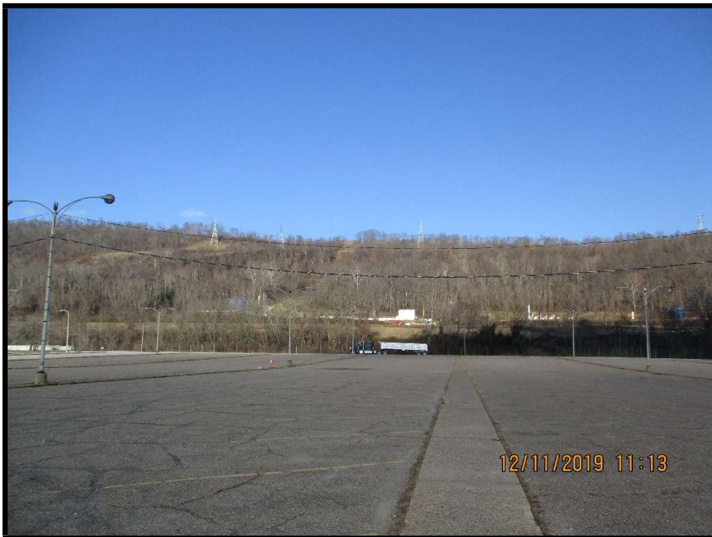
Photograph 20: View to N70W, towards powerlines and path of proposed pipeline.