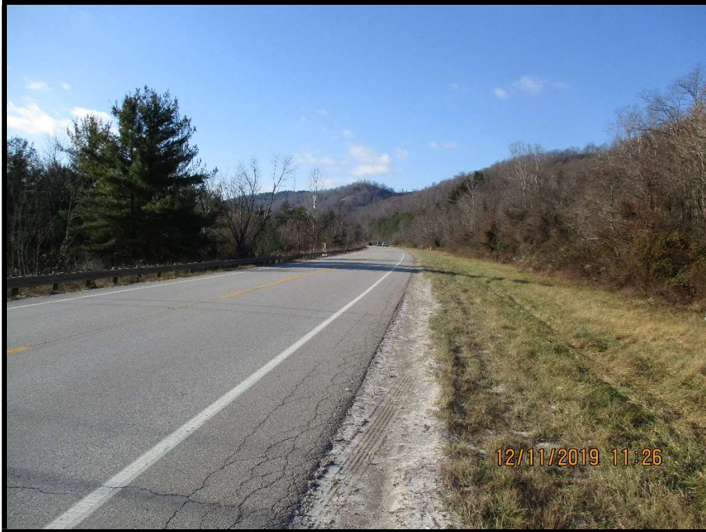
Photograph 23: View to the SW, along Rt. 7.