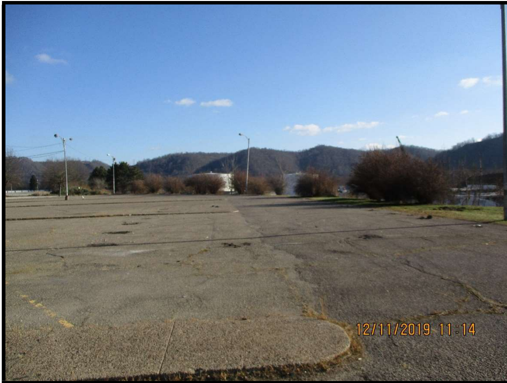
Photograph 21: View to the east towards tanks and superfund site beyond.