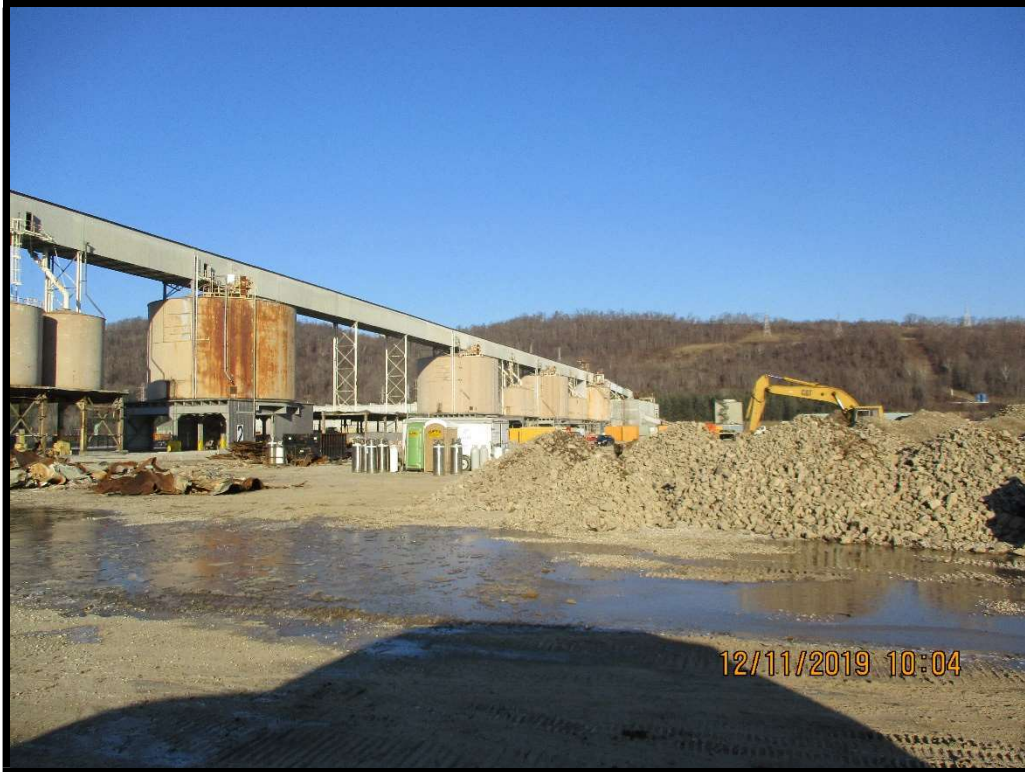
Photograph 7: View to the NE, with power lines on hill, blue tank from current drilling. Shown is the approximate path of pipeline downhill.