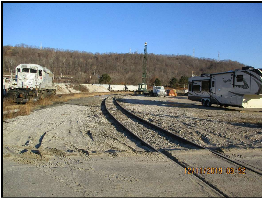
Photograph 4: View to the north, towards RR switch.