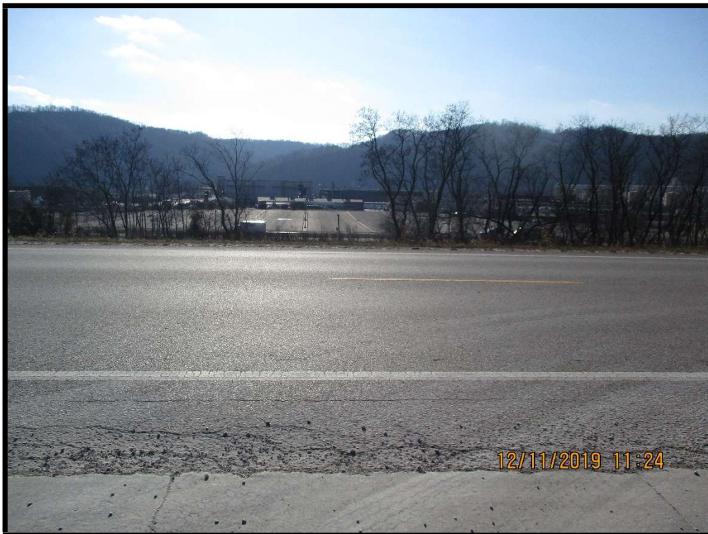
Photograph 22: View to the south towards the rolling mills, photo taken on Rt. 7.