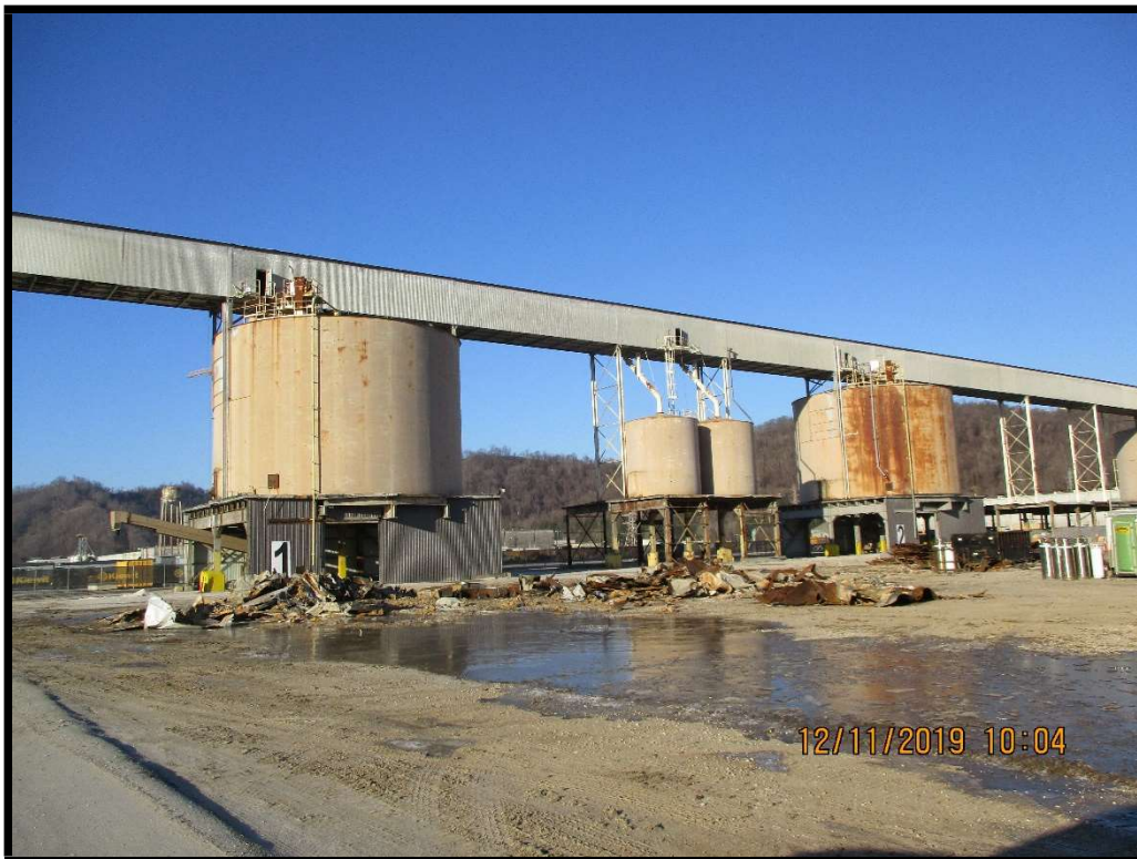
Photograph 6: View to the NE towards alumina bins. Photo shows bins and overhead belts. All else has been salvaged.