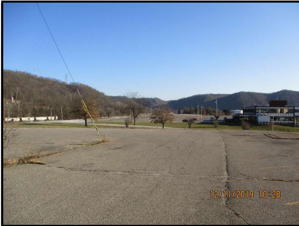
Photograph 13: View approximately N70E. Administration buildings on right. Parking lot in distance is approximate location of transload facility.