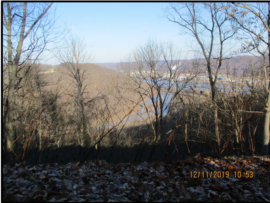
Photograph 17: View N10W, across Opossum Creek outlet into the Ohio River.