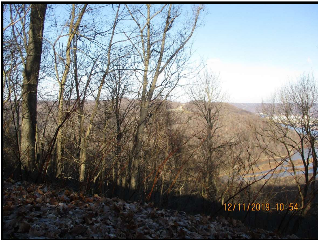
Photograph 18: View N30W, across Opossum Creek towards oil and gas disturbance.