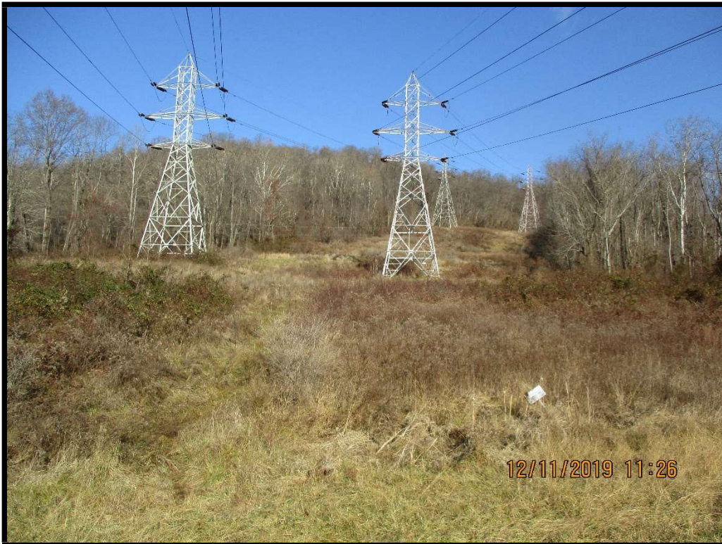
Photograph 24: View of the powerlines and approximate path of pipeline. View to the north.