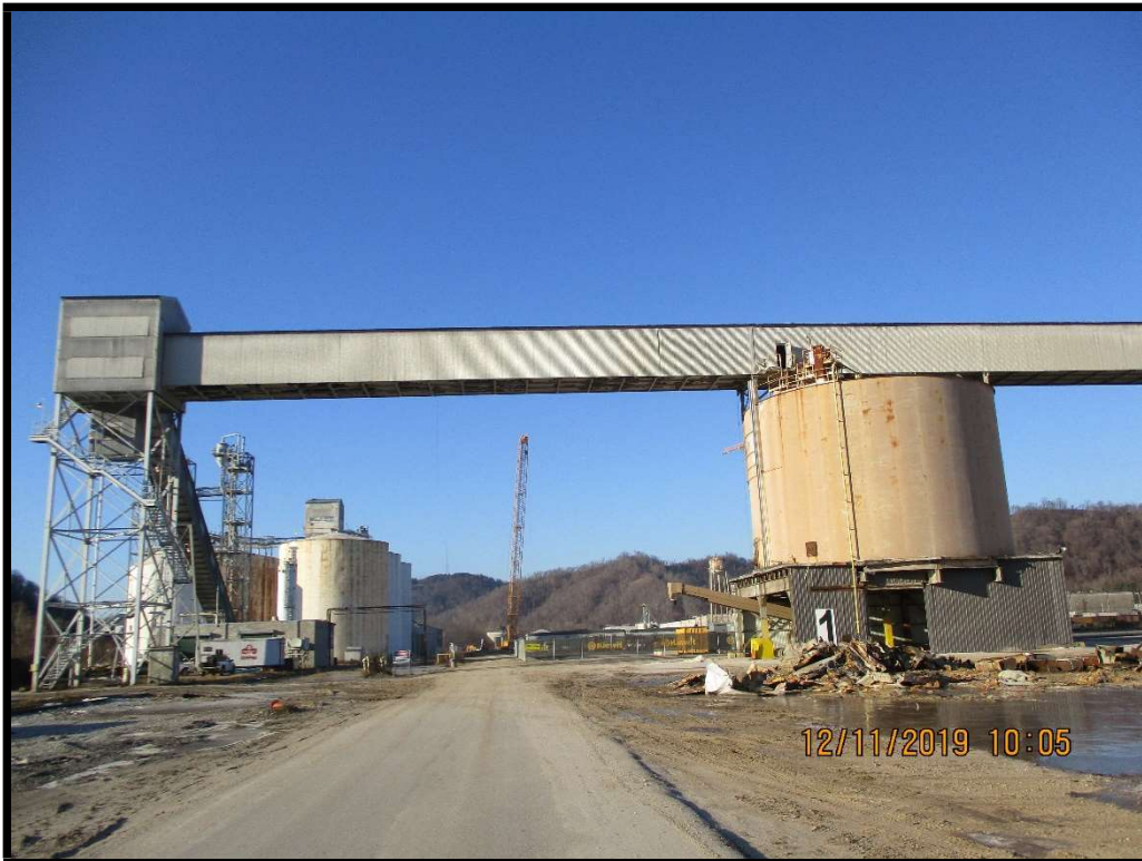
Photograph 8: View to the SW, showing terminus of alumina belt.