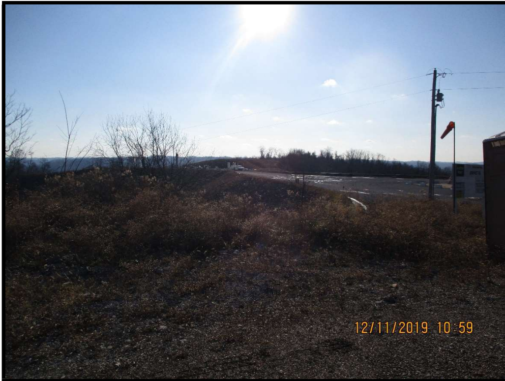
Photograph 19: View to south across drill pad.