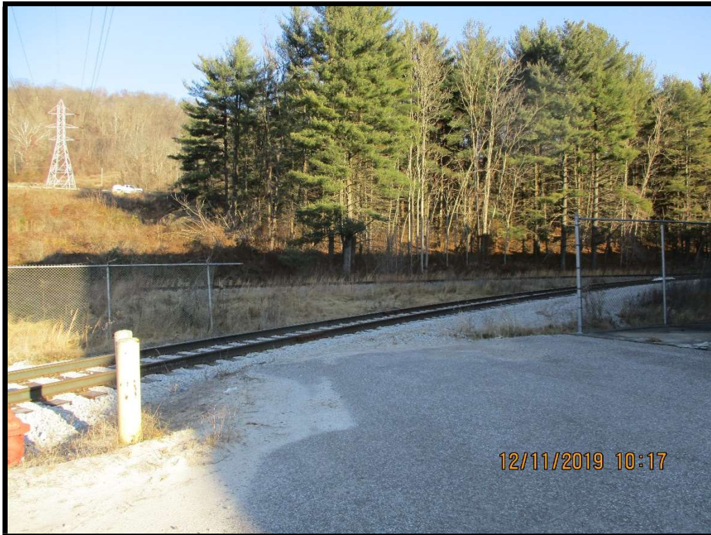
Photograph 11: View to the NW. Pickup truck on Route 7. Power lines show approximate path of pipeline.