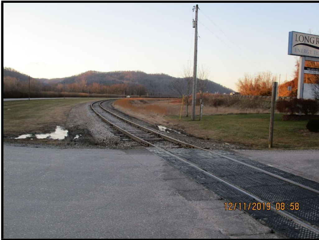
Photograph 3: Looking south along railroad tracks at main Longridge entrance.