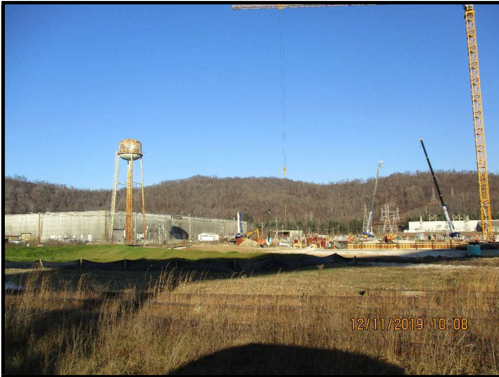
Photograph 9: View to the NW at the rolling mills. Note location of water tank.