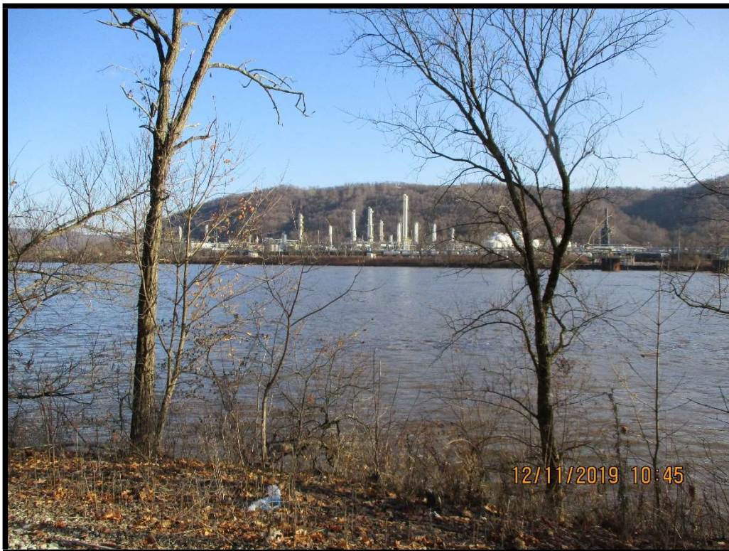
Photograph 16: View N70E on the banks of the Ohio River towards the Blue Racer facility and approximate location of pipeline crossing Ohio River.