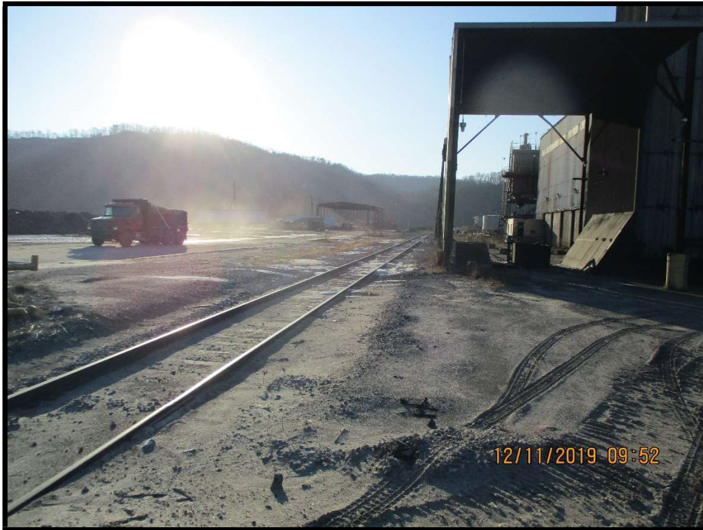
Photograph 5: View to the SE along the railroad loop.