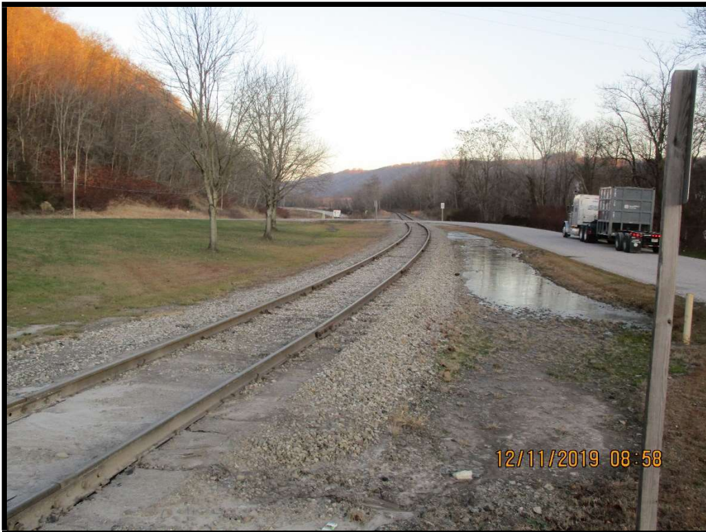
Photograph 2: Looking north along railroad tracks at main Longridge entrance.