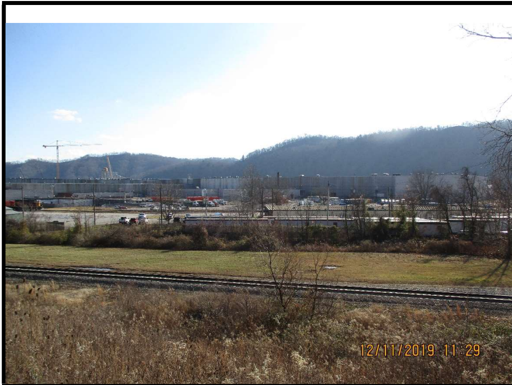
Photograph 27: View to S30E towards plant and across railroad tracks.