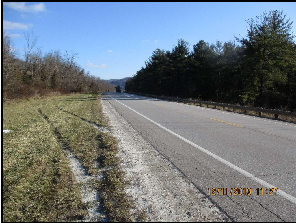
Photograph 25: View approximately N60E along Rt. 7, photo taken from roadside.