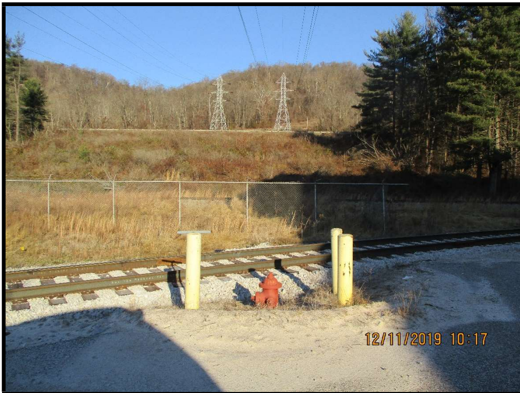
Photograph 12: View to the NE. Power lines. Approximate path of pipeline.