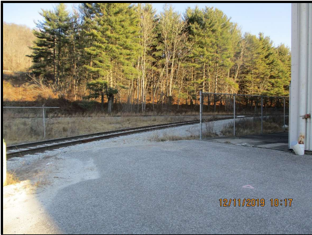
Photograph 10: Location of rail joining the main line. View to NW.