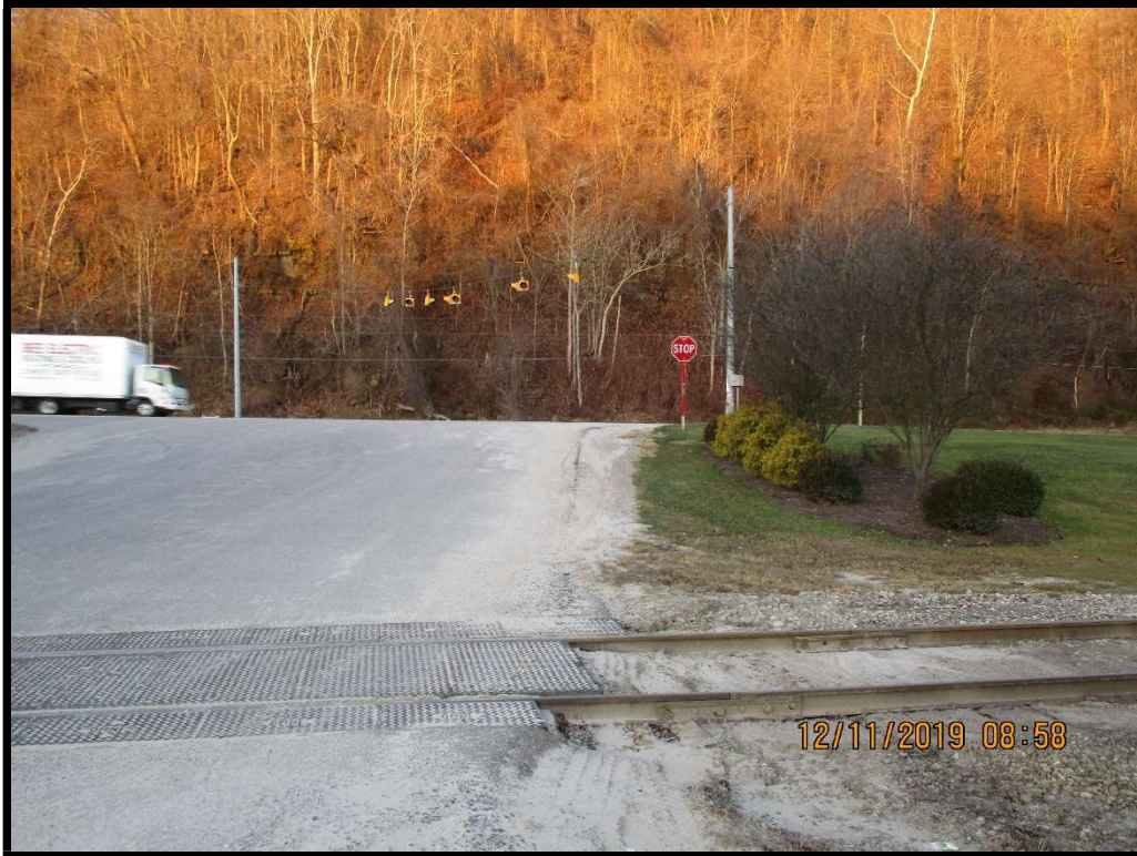
Photograph 1: View across railroad tracks and route 7 and Longridge entrance, looking east.