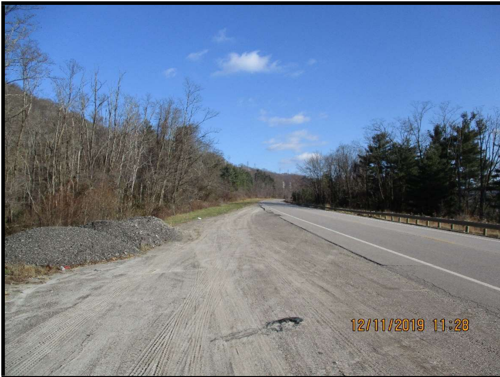
Photograph 26: View along Rt. 7, N50E.