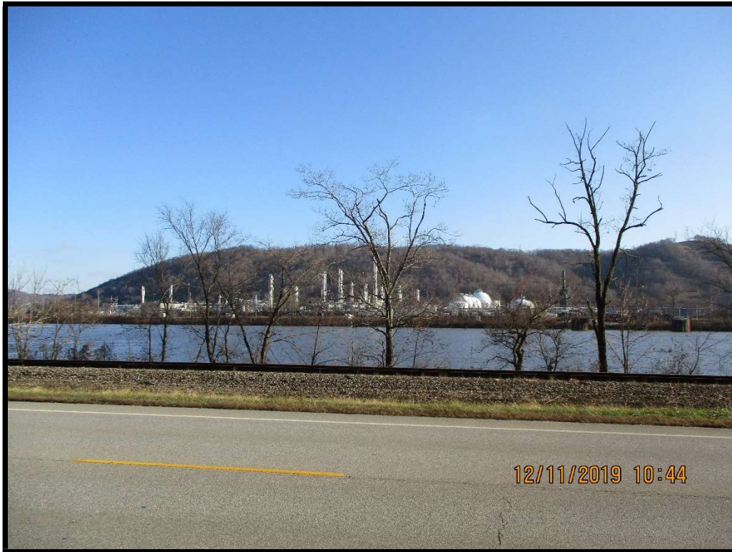
Photograph 15: View approximately N70E, view across Rt. 7, railroad tracks, Ohio River towards Blue Racer facility, where pipeline would cross Ohio River.