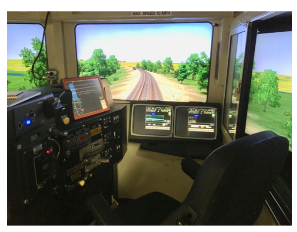
Figure 1. The right side of the CTIL, where the engineer typically sits

of the engineer's mental model. This study paired volunteer expert freight engineers with novice subjects with very little knowledge of rail operations as the operating crew of a freight train. The subject pair drove two routes together in the CTIL simulator (see Figure 1): one with the novice operator controlling the train (NAC, or "novice-at-the-controls") and the other with the expert engineer controlling the train (EAC, or "expert-at-the-controls"). The participant operating the train controls was unable to see the external environment, thus participants had to orally communicate necessary information to enable an appropriate control action.