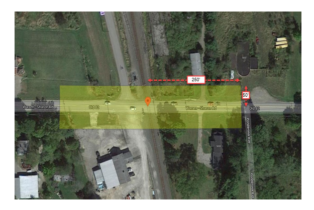
Figure 2. Example of a Buffer around a Grade Crossing

dataset, a polygon was created around each grade crossing to capture Waze jam data related to that grade crossing. Figure 2 shows a markup of a polygon at Warren Sharron Road grade crossing (Crossing ID 544729H) in Trumbull County, OH. The polygon is 250 feet long on both sides of the crossing with a 50-foot flatended buffer on both sides of the road.