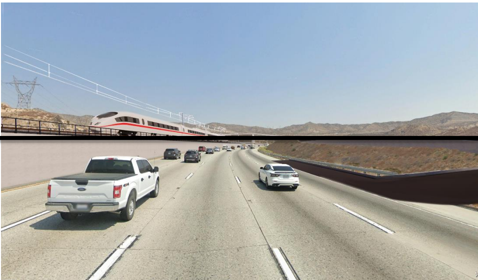
Visual Simulation, Build Alternative, KOP-6

Vividness: Average Intactness: Average Unity: Low Visual Quality: Average