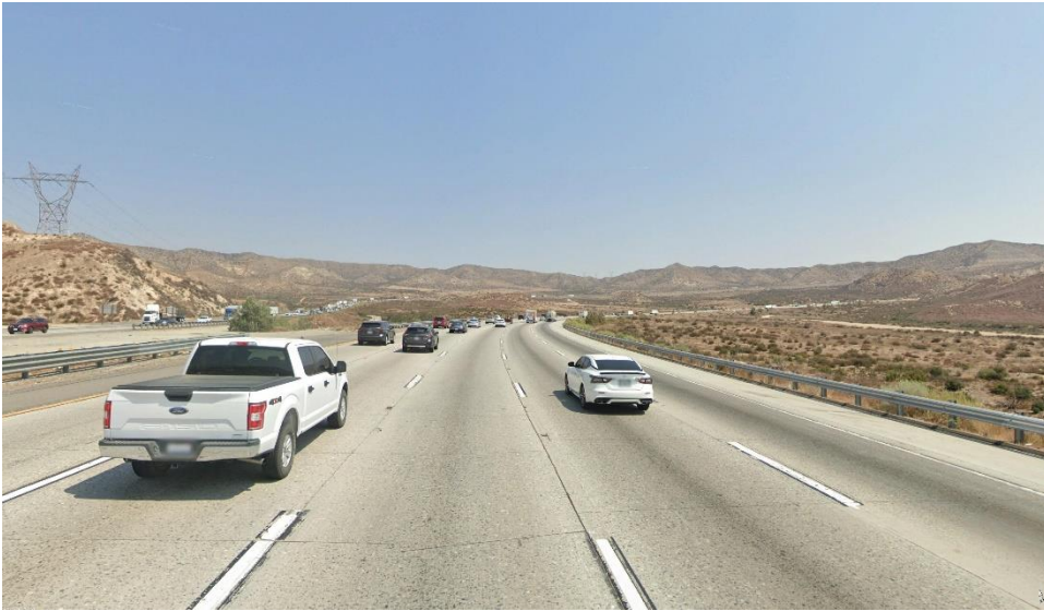
Existing Condition, KOP-6

Vividness: High Intactness: Average Unity: High Visual Quality: High