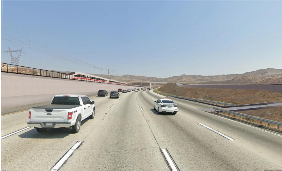
Figure 11. Key Observation Point 6, Cajon Pass/San Bernardino National Forest