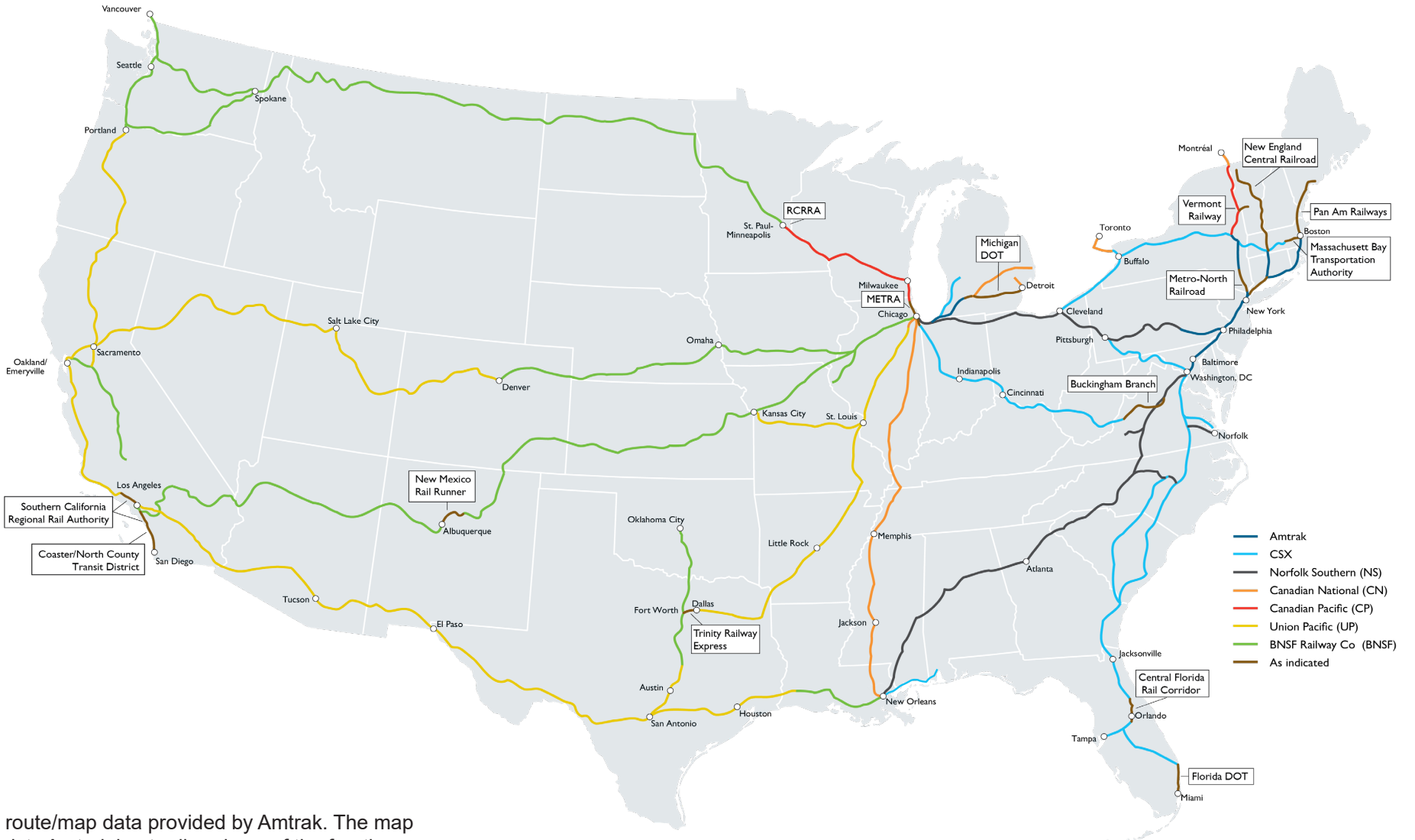
Figure 2. Amtrak Host Railroad Map

All route/map data provided by Amtrak. The map depicts Amtrak host railroads as of the fourth quarter of FY 2025.