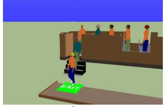
Figure 3. railEXODUS<sup>®</sup> vr – Egress to Low Platform

Figure 3 illustrates the virtual reality (vr) feature of the new railEXODUS<sup>®</sup> prototype software.