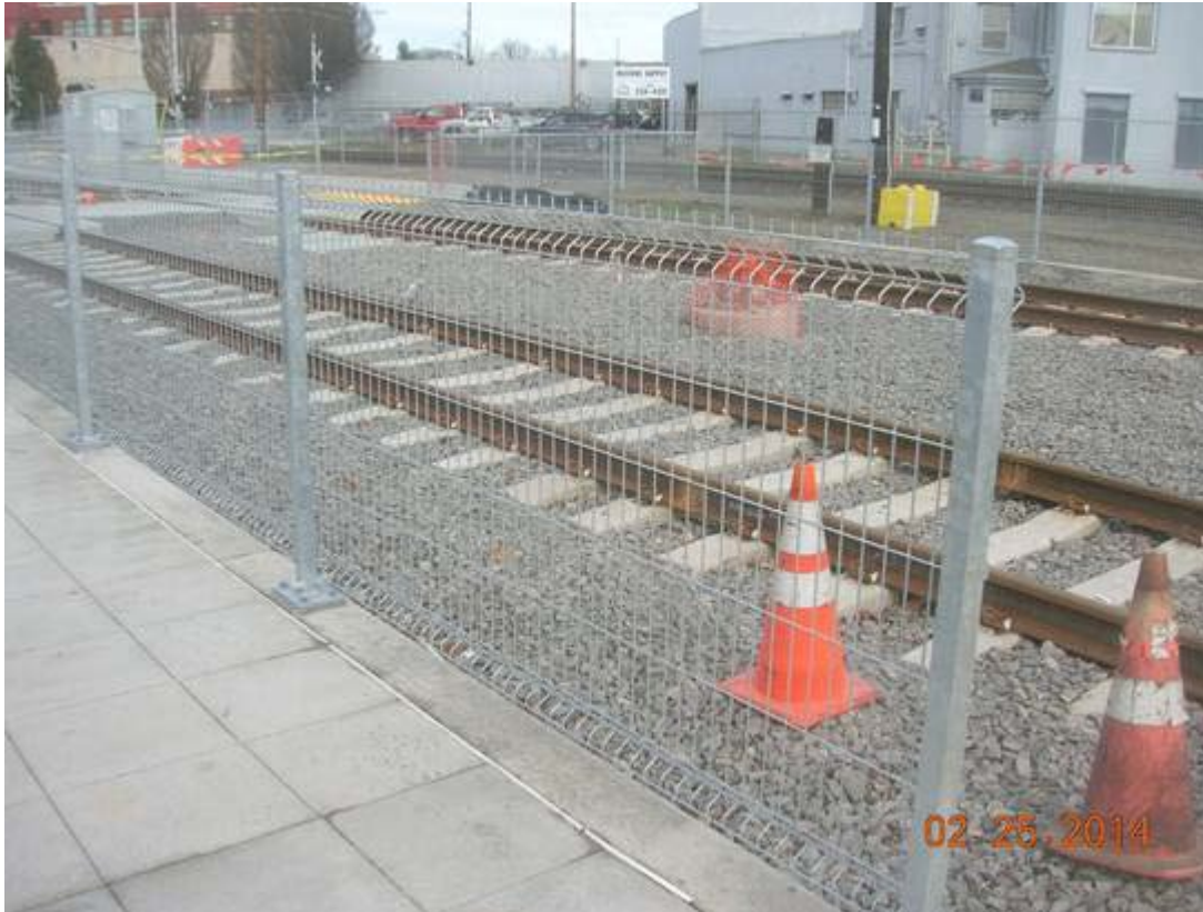
Figure 5. Welded-wire Fence Proposed for a new Rail Line at TriMet