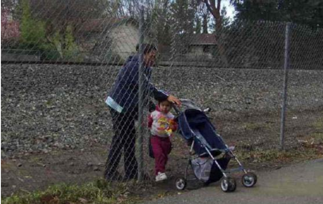
Figure 8. A Fencing Violation in Chico, CA