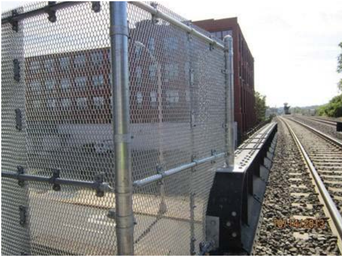
Figure 4. Interfacing High-security Fencing with Existing Infrastructure at NJT

In NJT's Policy on Right of Way Signage and Fencing 2 , its choice for security fencing is specific, naming a manufacturer and stating that the "Mesh Fence Fabric shall be made from a sheet of steel that is simultaneously slit and stretched into a rigid, open mesh diamond making one continuous sheet that cannot unravel. The finished shape of the mesh openings shall be diamond. Conventional expanded metal not manufactured specifically for security purposes is NOT permitted for this use". This type of fencing has successfully prevented trespass and typically it stays undamaged. The only known breach was in one location where trespassers stacked pallets in order to scale the fence.