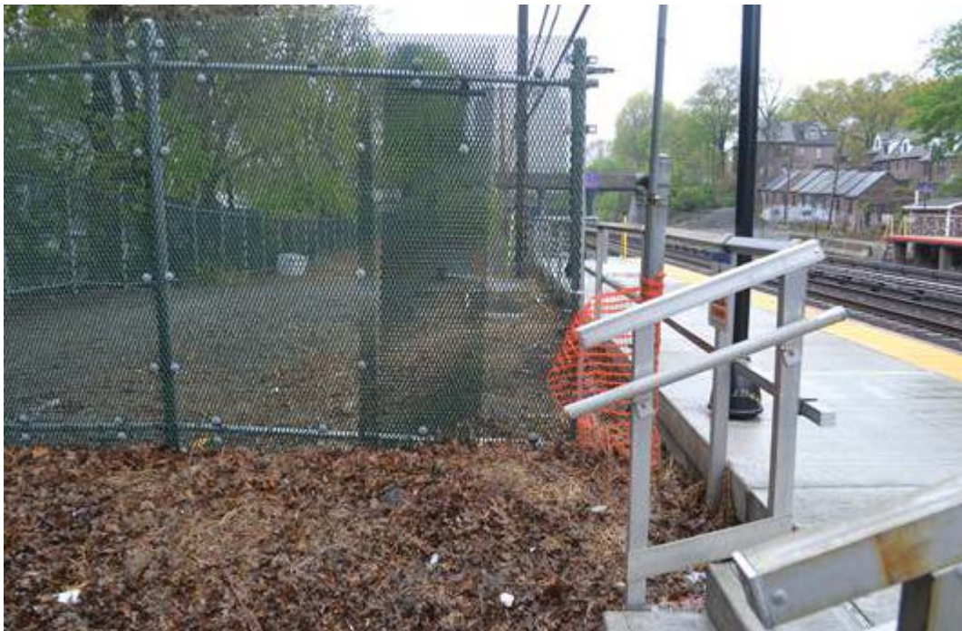
Figure 1. Overlapping Panels of High-Security Fencing at the LIRR

Figure 1 and Figure 2 below are examples of this type of fencing configuration by the LIRR.