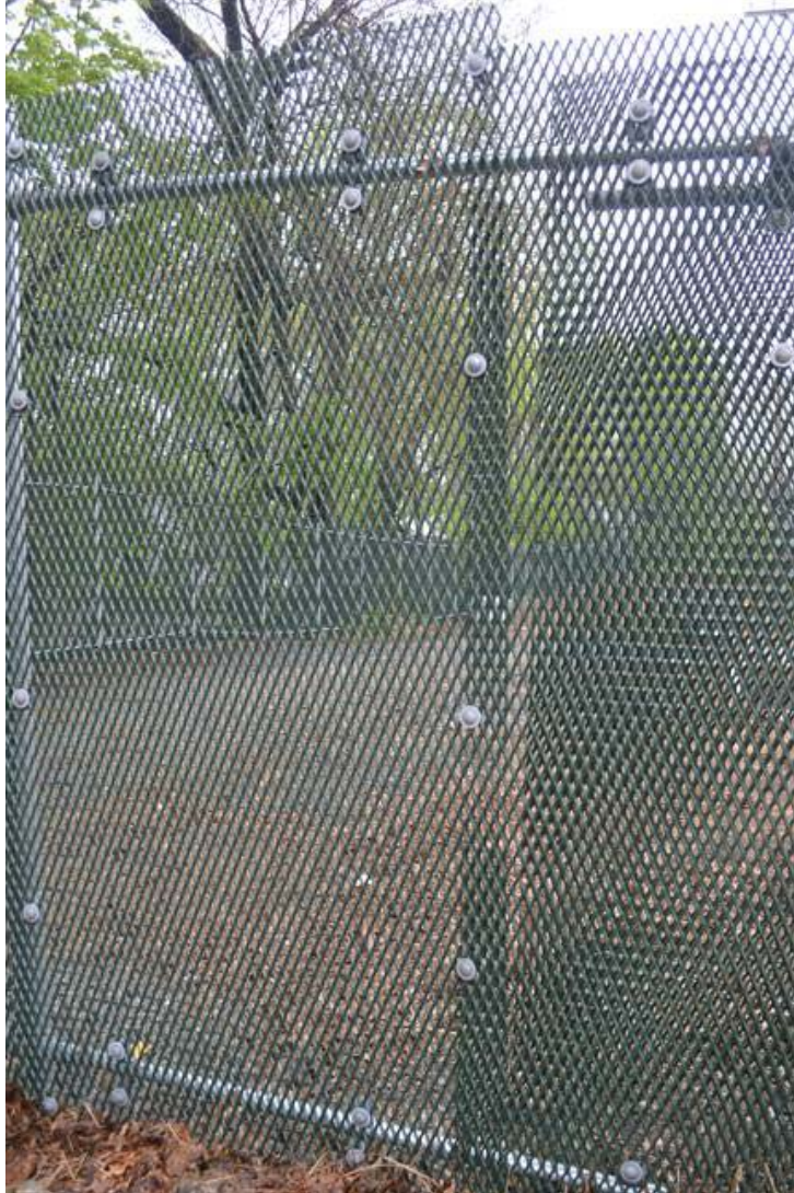
Figure 2. Offset Sections of High-Security Fencing at the LIRR

LIRR has discovered that high-security fencing works very well for its needs. If its fences suffer an impact (for example, by a car), only one section will probably be affected and not cause a replacement of the entire fencing system. Also, by design, expanded metal grating fencing is difficult to climb and cut, making it suitable for ROW trespass deterrence.