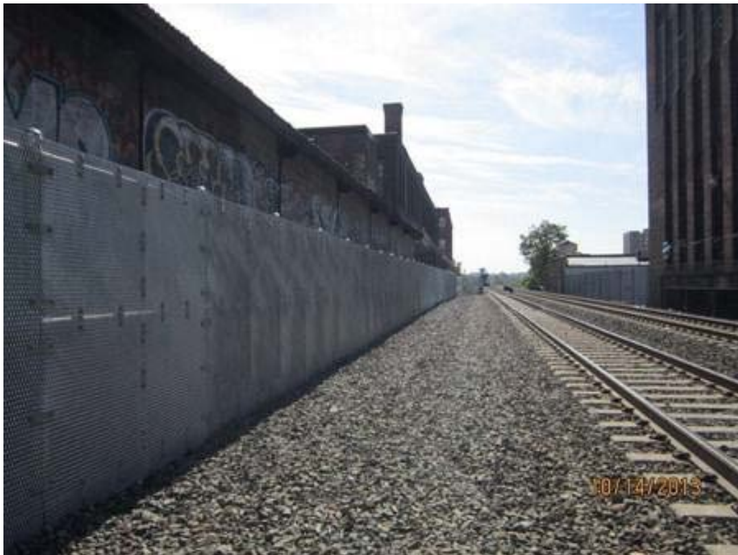
Figure 3. High-security Fencing on NJT's ROW

New Jersey Transit (NJT) is another railroad agency that uses high-security fencing. Over the last ten years, it has been installing fencing along the ROW. For the first time, NJT installed high security fencing in 2002; the fencing was added to a line with a single track ROW that experienced high levels of trespassing. In 2003, NJT installed an additional 20,000 ft. of high-security fencing. The agency's high-security fencing has a tight weave that cannot be cut by standard tools (Figure 3). Figure 4 shows how this fencing can be joined with existing infrastructure.