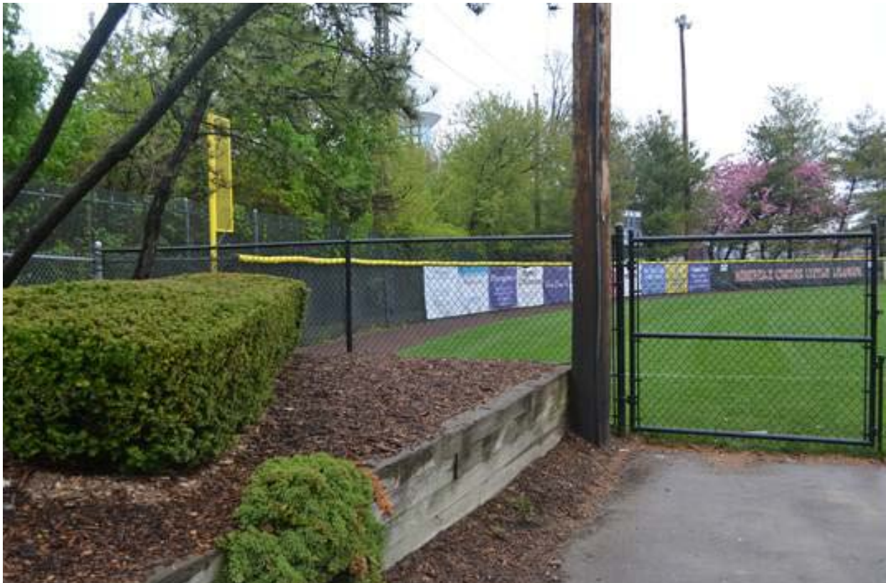
Figure 6. High-security Fencing Installed by LIRR Behind Community Baseball Field

The LIRR worked with local officials and parents to install high-security fencing between the ROW and a community baseball field's outfield that abutted the railroad property. Historically, whenever a home run or long foul ball was hit, a player would access the ROW to retrieve the ball. Since the installation, access is restricted and safety is ensured. The fencing configuration is shown in Figure 6 and Figure 7.