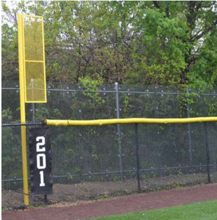
Figure 7. High-security Fencing Installed by LIRR Behind Community Baseball Field