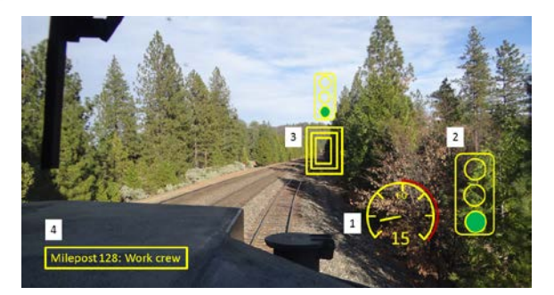
Figure 1 –The prototype HUD design. The symbology includes (1) a speed display, (2) in-cab signals, (3) a moving dynamic element highlighting external objects of interest, and (4) a message box for upcoming events.

The prototype HUD design is based on a set of information requirements created by Voelbel [2] for an in-cab situation awareness display that is used in passenger rail operations. These requirements use a hybrid Cognitive Task Analysis of en route operations as a basis for step-by-step descriptions of an engineer's critical tasks and decision processes. Finally, the requirements traced the design of the individual display elements back to each task.