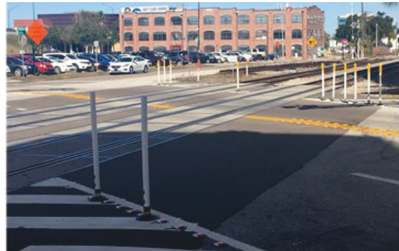
Figure 1. ROW Incursion Treatments Installed at the W. Washington St. Crossing in Orlando, FL

significantly at both crossings, down 75 percent at the W. Washington St. crossing and 67 percent at the W. Jefferson St. crossing over the 2-year evaluation period.