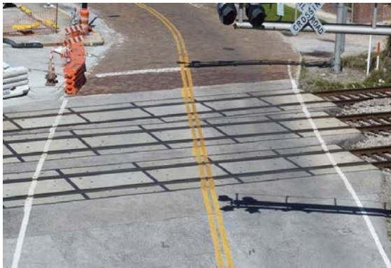
Figure 3. ROW Incursion Treatments Installed at the W. Jefferson St. Crossing

The W. Jefferson St. crossing was equipped with the first two treatments (pavement markings only) and the W. Washington St. crossing was equipped with all four treatments. This was done to determine if the addition of reflective markers and delineators provided added safety. The treatments installed at the W. Washington St. crossing were shown previously in Figure 1. Figure 3 shows the pavement marking treatments installed at the W. Jefferson St. crossing.