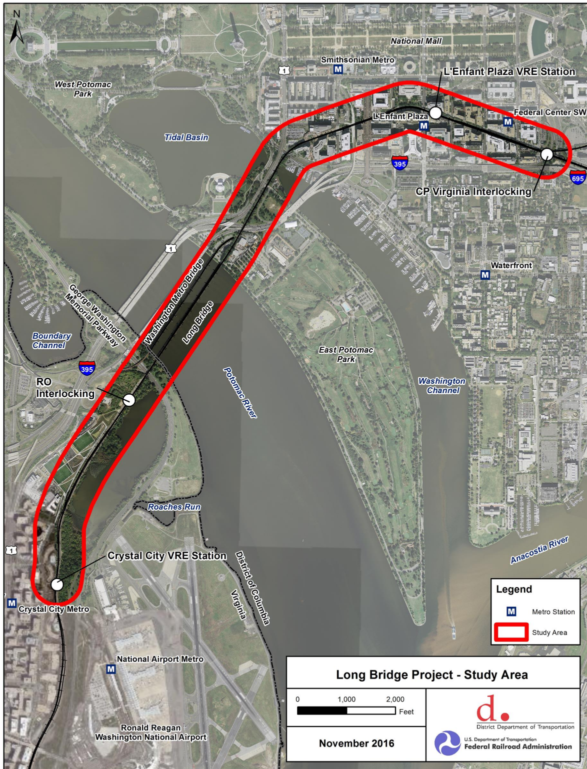
Figure 1: Long Bridge Project - Study Area