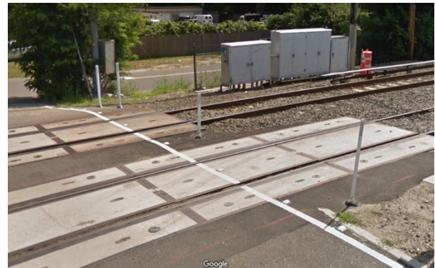
Figure 2. ROW Incursion Treatments Installed at the LIRR Crossing on Pond Road in Ronkonkoma, NY (Crossing ID 338175R)

LIRR completed the installation of the white pavement markings, reflective markers, and delineators at all of their 296 grade crossings in the summer of 2018. An example of this treatment as installed at Pond Road in Ronkonkoma, NY (Crossing ID 338175R) is shown in Figure 2 .