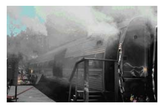
Figure 1. Full-scale fire test

Based on the results of this research program, the material fire performance table, as originally issued by FRA in the form of guidelines in 1984 and 1989 was revised and issued on May 12, 1999, as part of the Passenger Rail Equipment Safety Standards (49 CFR, Part 238). A clarification of the fire performance requirements was issued and published on June 25, 2002.